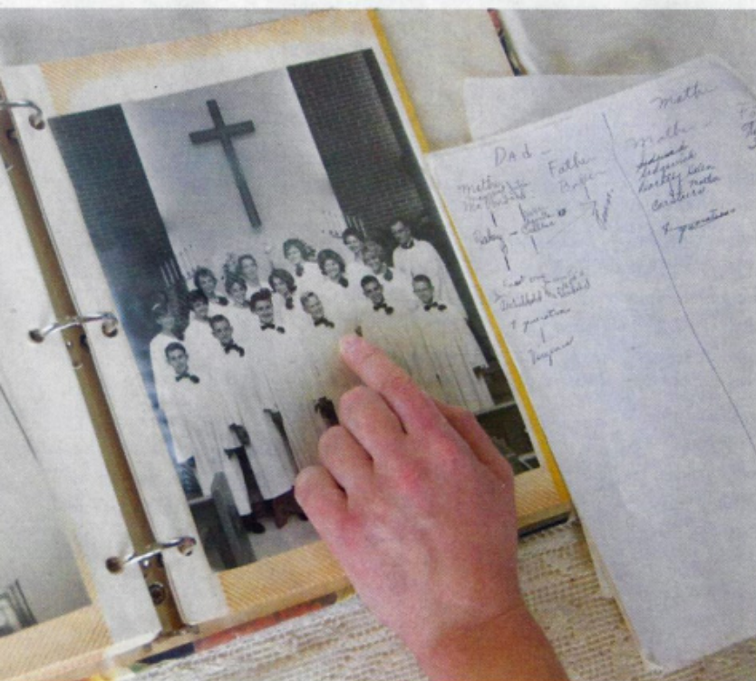
DANIEL JOHNSON (2)

If possible, seek out and visit cemeteries where your ancestors are buried, taking stone rubbings for your personal records.